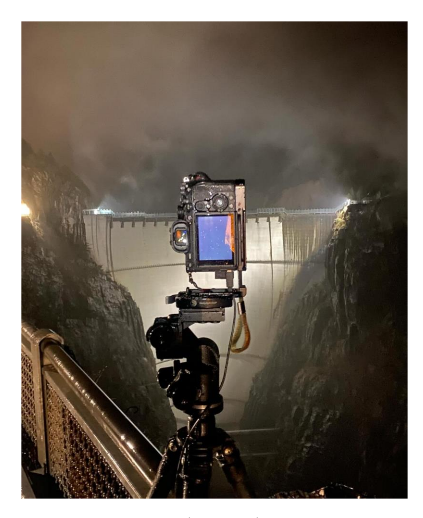
Wouter Stelwagen on location